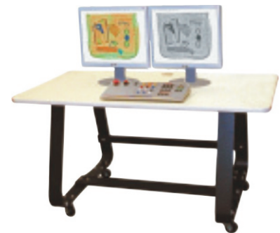
Available operator table and dual or LCD monitors (one 17" CRT is the normal configuration).

Control Screening is the leading worldwide producer of fast, reliable and sophisticated X-ray, Metal and Trace Detection screening systems. Visit us at www.controlscreening.com . Ask about our mobile and cargo systems. Our advanced systems and options are often integrated, leased or rented.