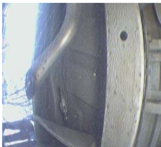
Zoomed image of a feature showing hidden Handgun